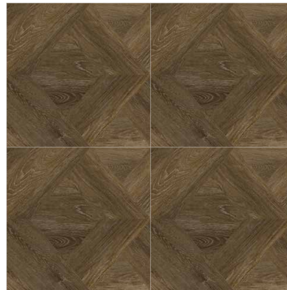
●At.Viggo Nogal 60,8x60,8 M10 15-440-034-8972 ●

TIERRA COLOREADA COLOURED BODY MASSE COLOREÉ