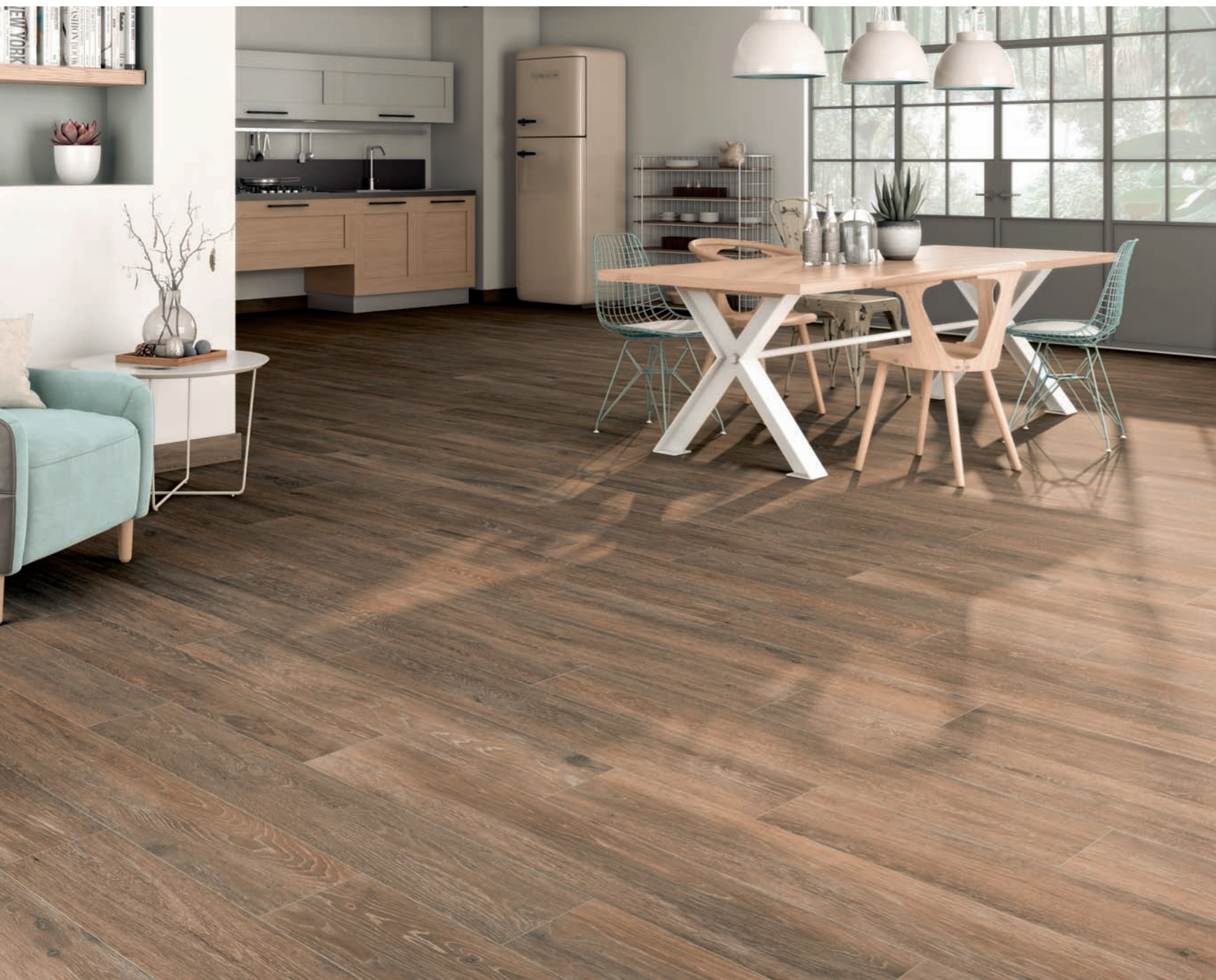
Pvto. / Floor / Sol: At. Viggo Nogal 20x120