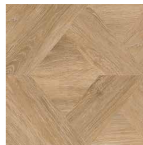
●At.Viggo Fresno 60,8x60,8 M10 15-440-018-8972 ●