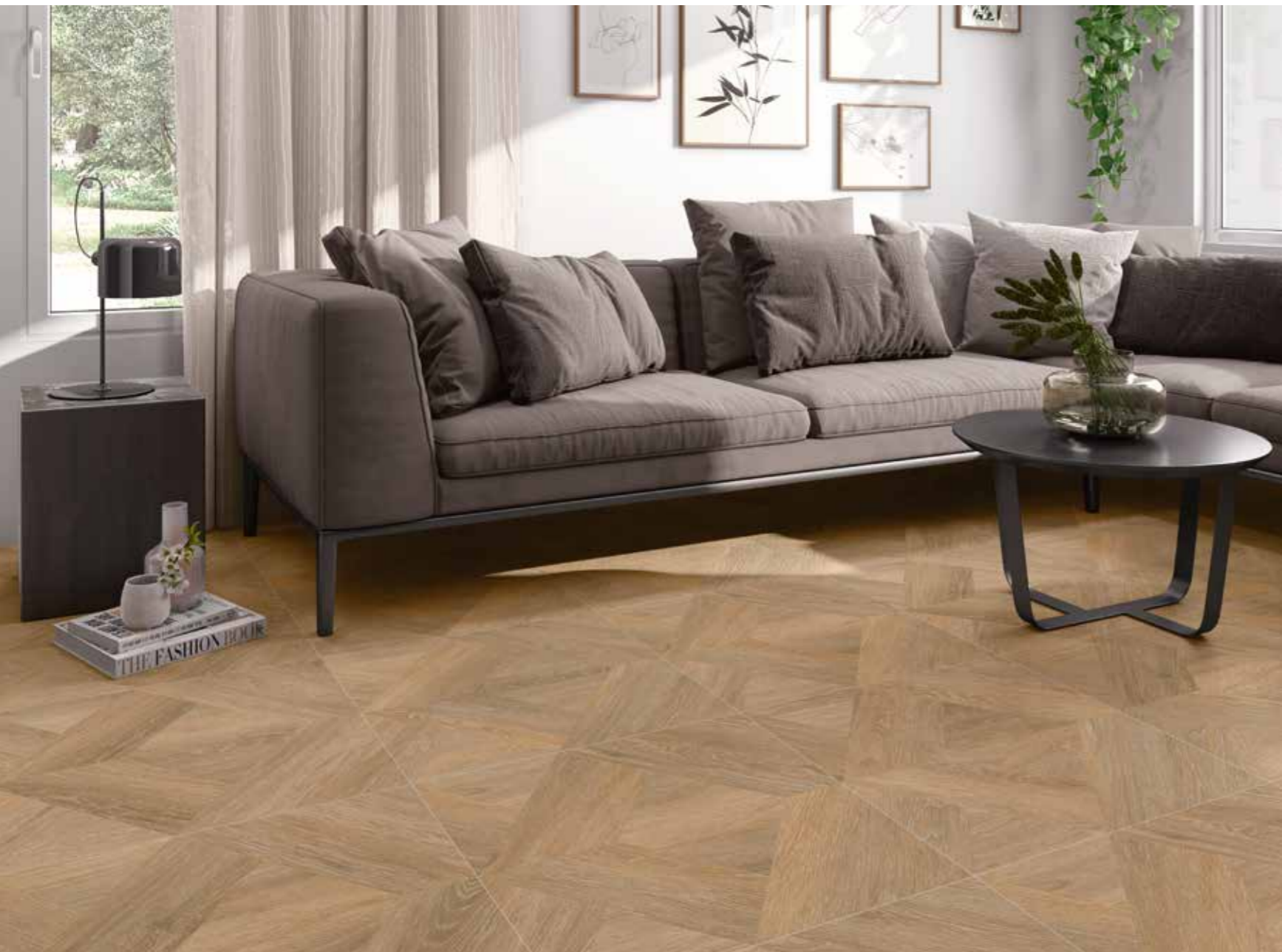
Pvto. / Floor / Sol: At. Viggo Fresno 60,8x60,8