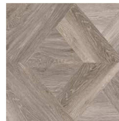
●At.Viggo Roble 60,8x60,8 M10 15-440-036-8972 ●